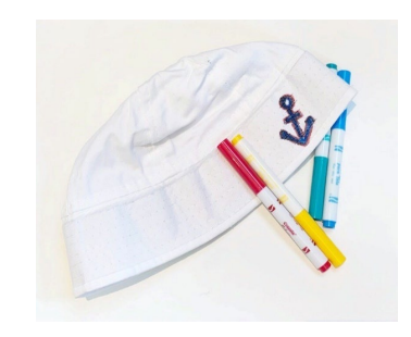
Perfect for camp outings!

Great solution for senior and youth groups: reduced pricing while minimizing staff set-up time