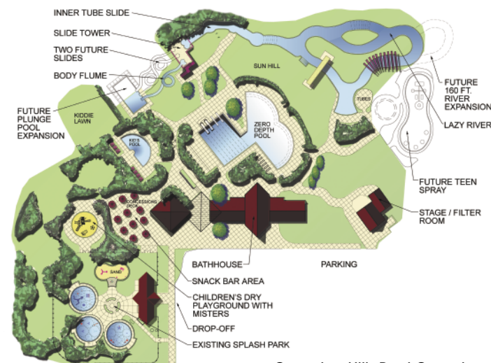
Campton Hills Pool Complex