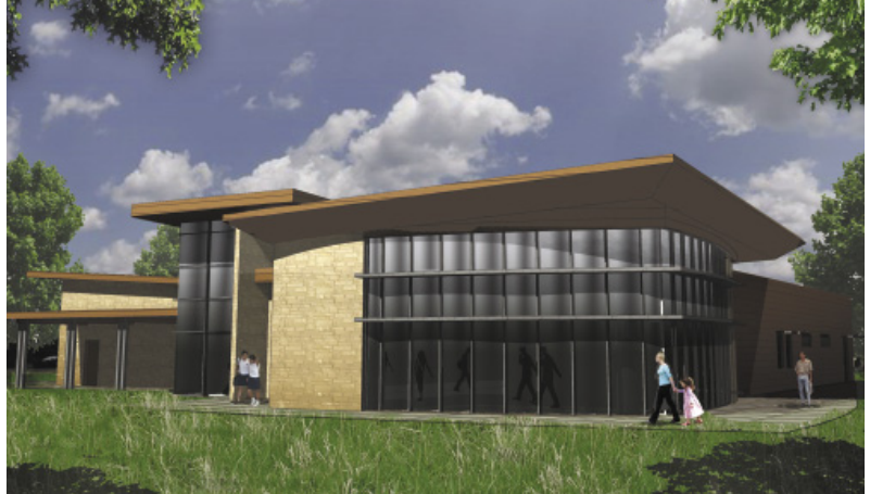
Proposed Environmental Education Center